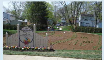
Community Garden in Ohio