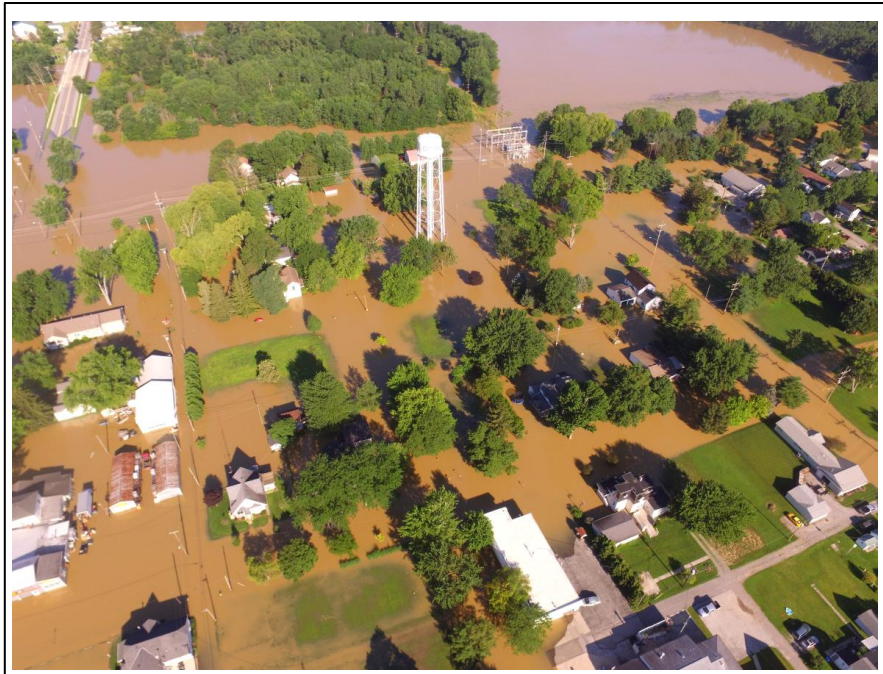
Figure 2 - The result of flood acquisitions in Ottawa throughout the years. Note the number of houses near the water tower in the 2007 photo (top, from August 23, 2007) and the open space around the tower in the 2017 photo (bottom, from July 15, 2017).

The buyouts are distributed across the community, but fall in several clusters (See Figure 3). The first is the former Arrowhead Mobile Home Park, the second is the West End properties. In addition, several smaller lots are distributed across the community, including one property downtown – Paul’s lot – and a string of properties south of town – off of Oak Street (see map).