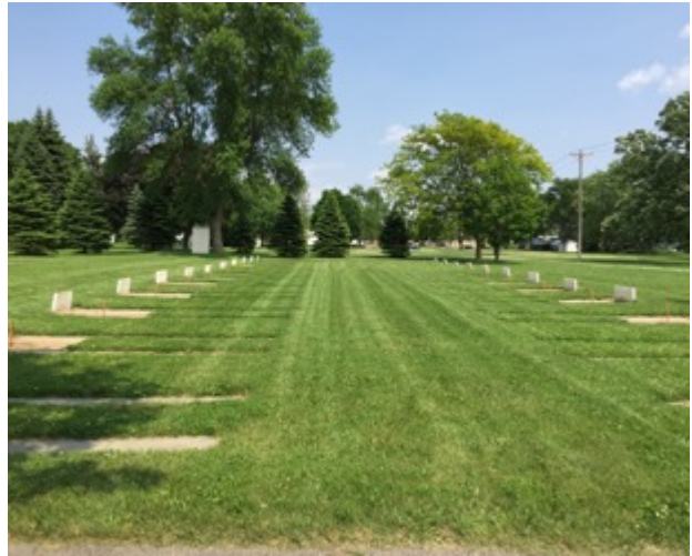
Figure 6 – Recreation Opportunities