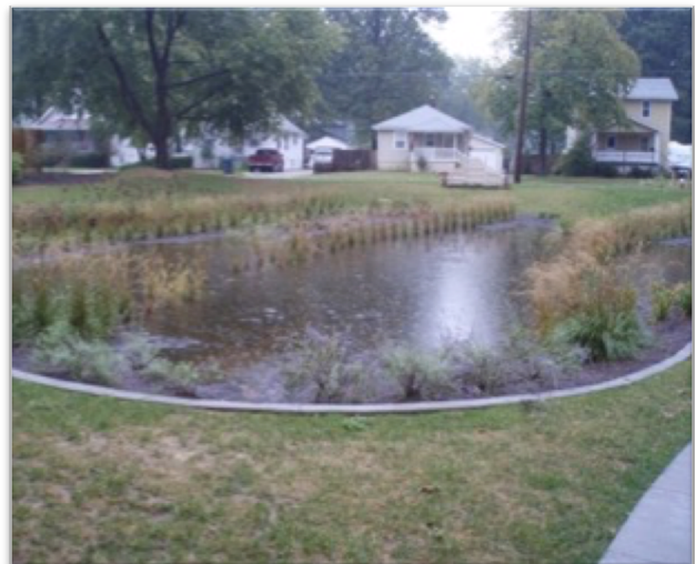
Figure 5 – Gardens and Green Infrastructure