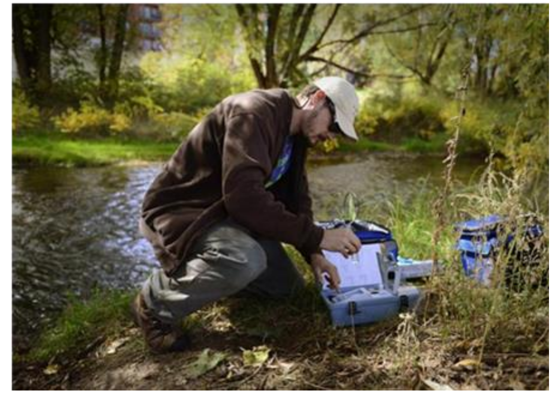
Volunteer monitoring in Lower Bear Creek.