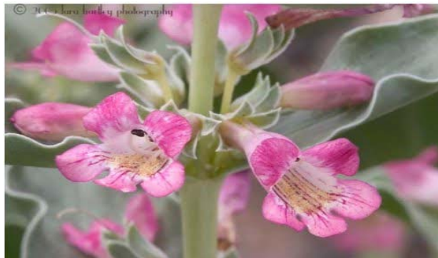
White margined beardtongue, Penstemon albomarginatus