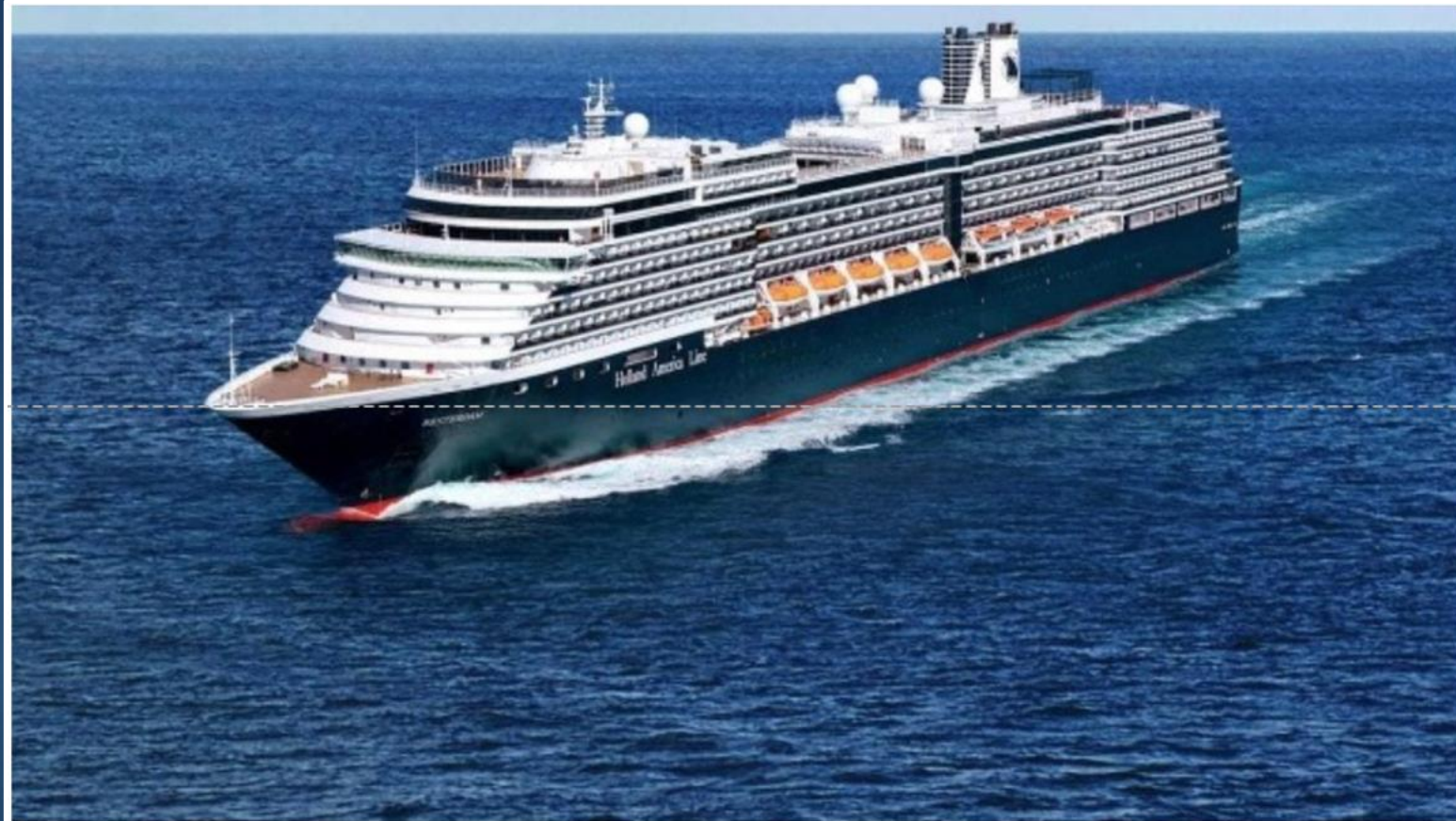
The Westerdam

Whistleblowers Key to $60M Penalties Imposed on Carnival Cruise Lines for Pollution & Cover Up