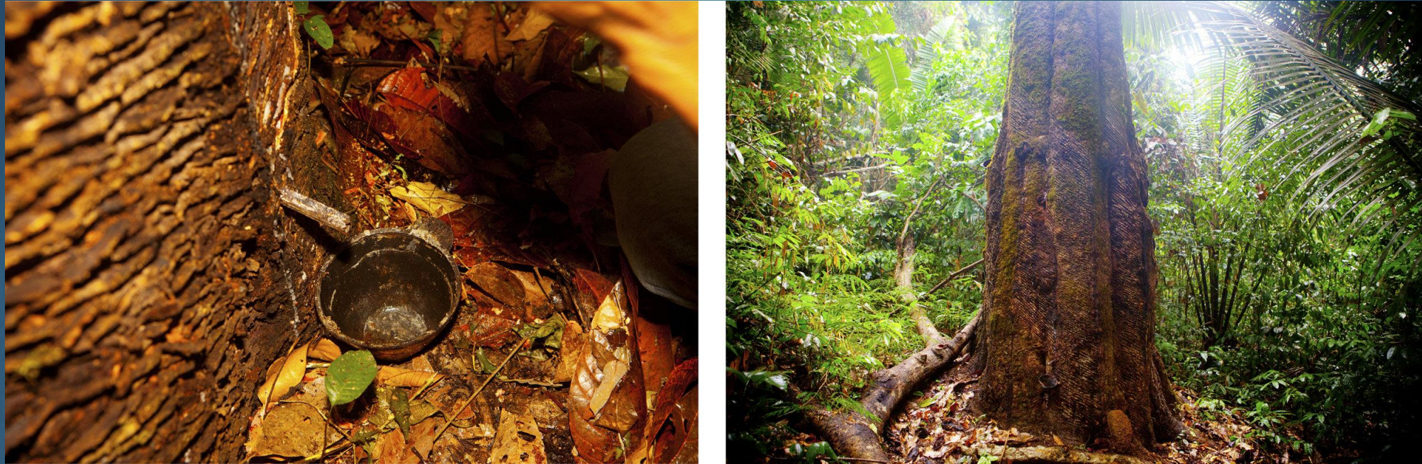
Extractive Forest Reserve in Machadinho d'Oeste, Brazil