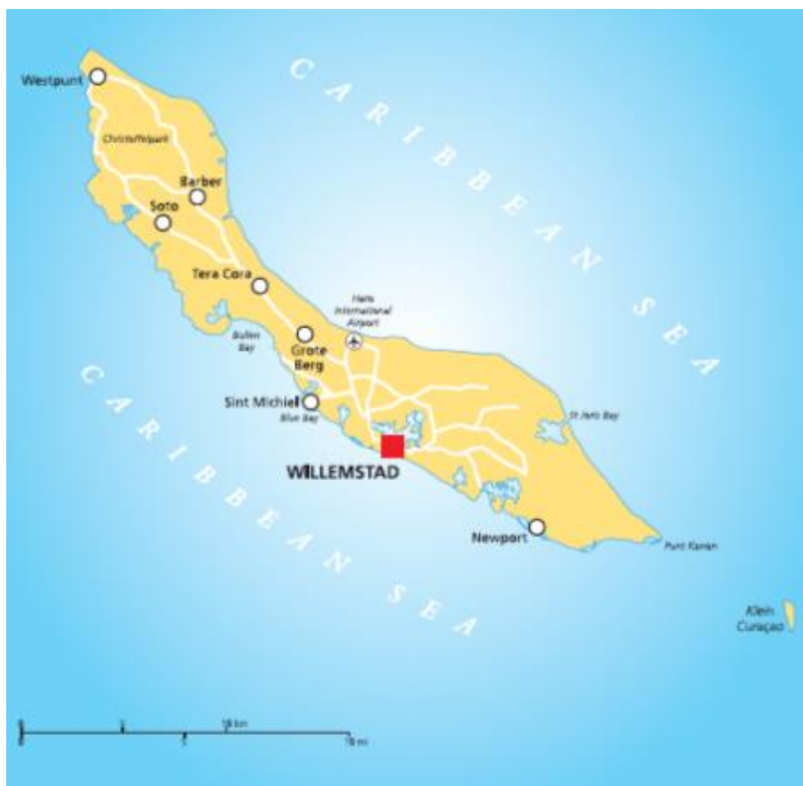
Figure 1. Map of Curaçao. 13

activities, such as salt mining, were eclipsed in the twentieth century after development of an oil refinery to process crude from nearby Venezuela. While the profitability of the petroleum services sector has declined more recently, the industry remains important. Other economic drivers include financial services and, notably, tourism. Curaçao is an incredibly popular tourist destination, with over 200 cruise ship visits per year, as well as substantial arrivals by air. 9 Curaçao's ocean environment is critical to tourism, with beach recreation and dive tourism forming a substantial portion of the tourism sector. 10 Fisheries employs a small number of full-time fishermen with many others who fish part time. 11 While it accounts for less than 1% of the gross domestic product, it is important culturally as the result of a strong fishing tradition and also serves as a local food source. 12