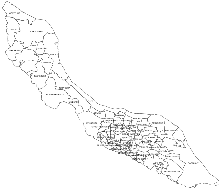
Figure 2. Curaçao Geozones. 14