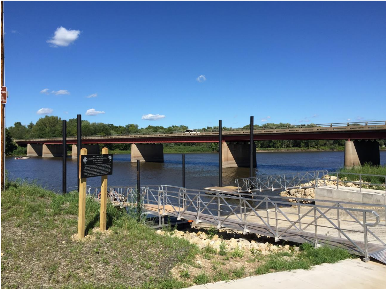
Bridge at Trenton Island.