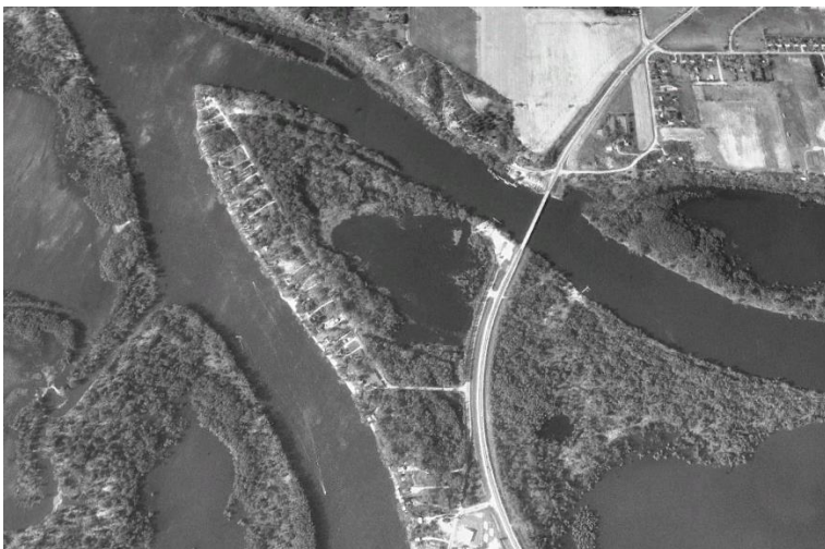
Figure 3: Homes on Trenton Island, 1992