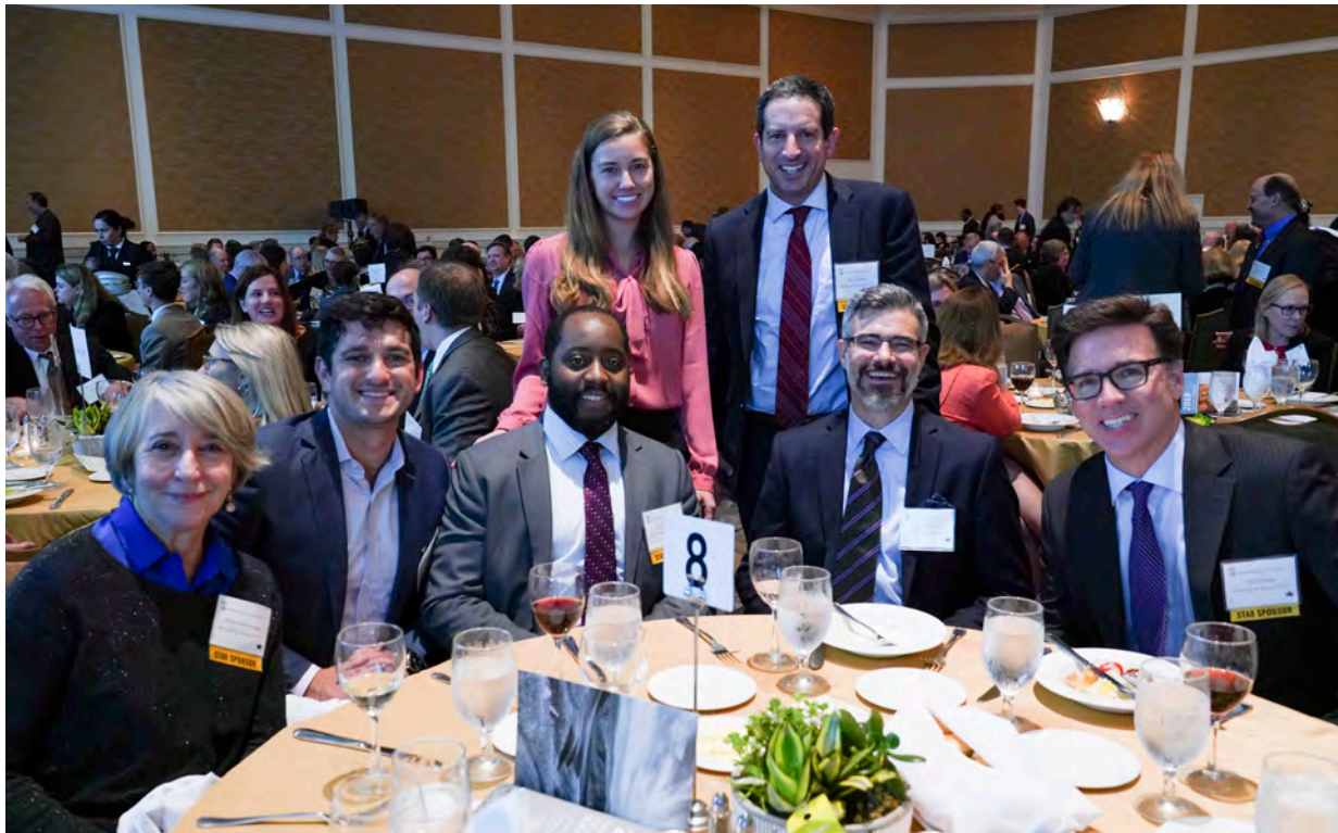
More than 700 Professionals attend the ELI Award Dinner each year.

The ELI Award Dinner convenes the environmental law and policy field each fall. ELI Professional Program members are guaranteed a seat at this not-to-be-missed event.