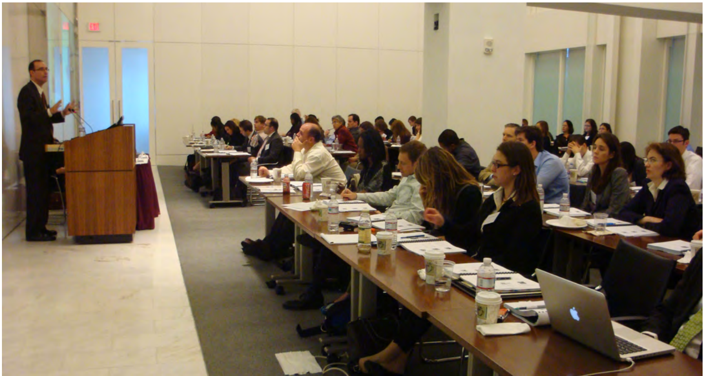
ELI's annual Boot Camps on Environmental Law ® attract participants from all across the United States.

Participating member firms also receive The Environmental Forum , ® our award-winning policy magazine for environmental professionals, access to the full suite of products from our flagship publication, ELR—The Environmental Law Reporter , ® and complimentary copies of new releases from our book division, ELI Press. Member firms are also invited to send new attorneys or other staff to one of ELI's unique Boot Camps on Environmental Law ® and to the ELI Summer School series designed for legal interns and summer associates.